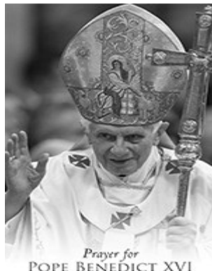
Prayer for POPE BENEDICT XVI

The Holy Father brought the tender heart of a pastor, the incisive mind of a scholar and the confidence of a soul united with His God in all he did. His resignation is but another sign of his great care for the Church. We are sad that he will be resigning but grateful for his eight years of selfless leadership as successor of St. Peter. The occasion of his resignation stands as an important moment in our lives as citizens of the world. Our experience impels us to thank God for the gift of Pope Benedict. Our hope impels us to pray that the College of Cardinals under the inspiration of the Holy Spirit choose a worthy successor to meet the challenges present in today's world.